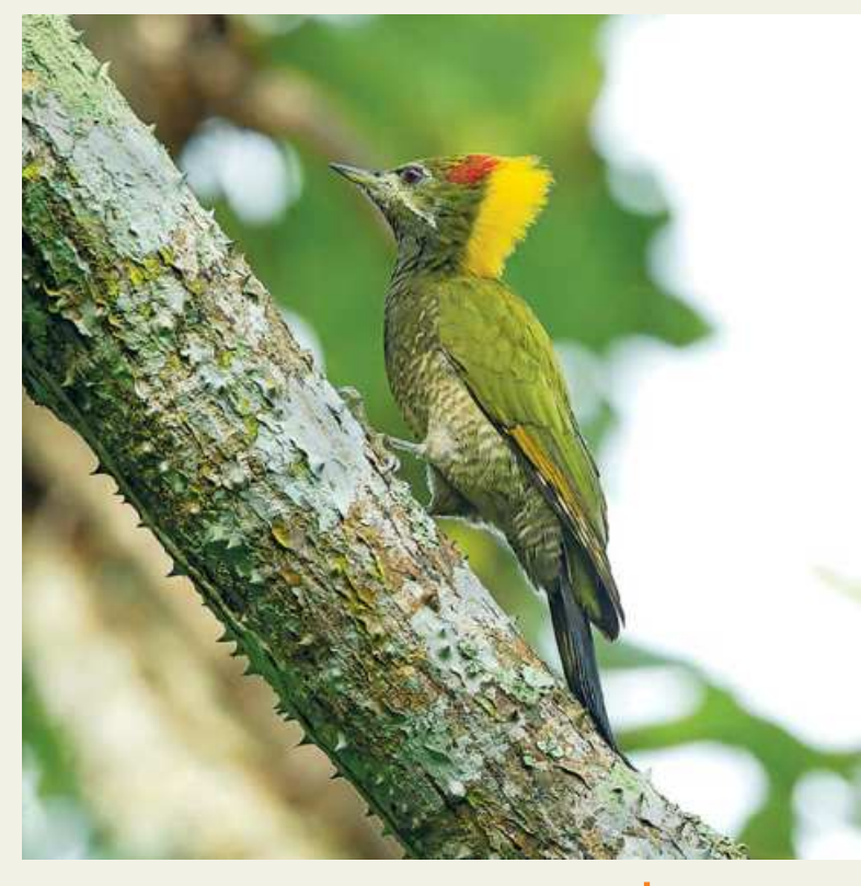
Lesser Yellownape, Kalenga Forest, Habiganj.

There are 218 species of woodpecker in the world. Nineteen of them can be seen in Bangladesh. They vary in colour and range in