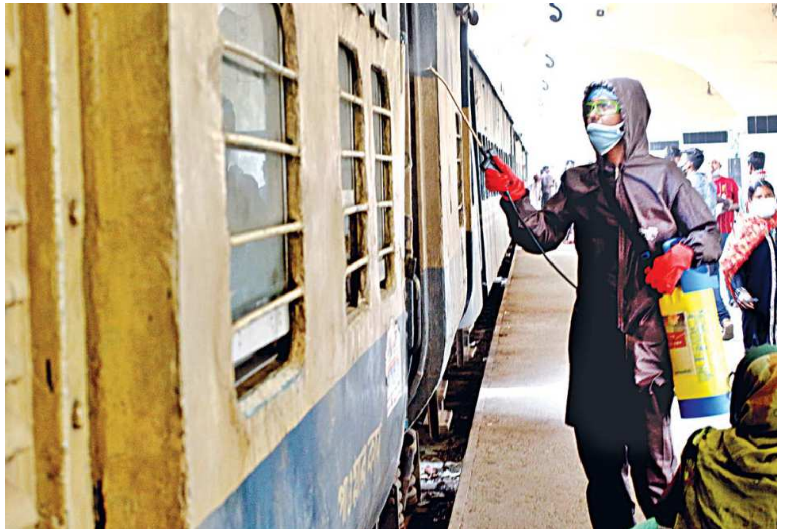
A volunteer of Bidyanondo, a voluntary organisation, sprays disinfectant on the coach of a train at Kamalapur Railway Station in the capital yesterday to check the spread of coronavirus. Three more Covid-19 patients were identified in the country yesterday, increasing the number of such cases to 20.