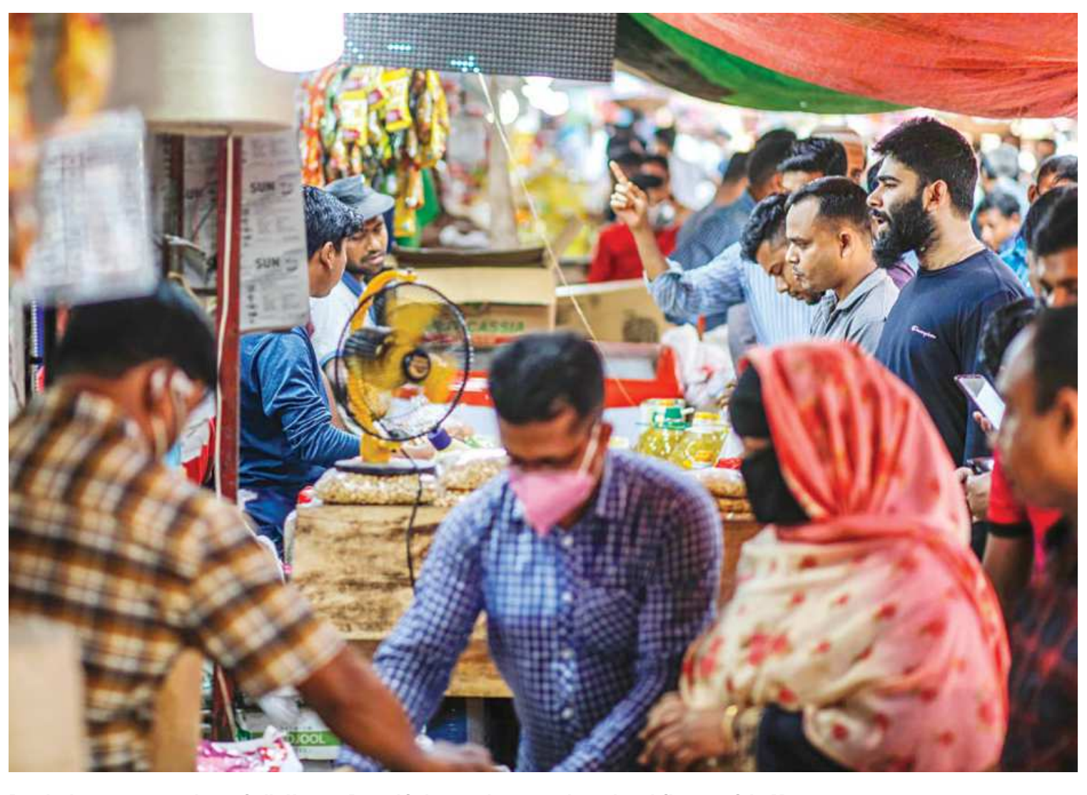
People throng stores at the capital's Karwan Bazar kitchen market yesterday to buy daily essentials. Many are stockpiling essentials fearing possible lockdowns due to the coronavirus outbreak.

Countries across Africa and Asia have heavily restricted travel, imposed quarantines and closed schools, with fears for impoverished communities SEE PAGE 17 COL 3