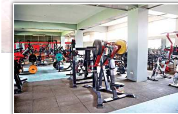
The gym at the BCB Academy in Mirpur remained almost empty with most players opting to stay at home due to the coronavirus pandemic, although a handful of players like Al-Amin Hossain (L) and Forhad Reza practised individually yesterday. However, following BCB's directive of 'no cricket until further notice', the BCB headquarters may see even fewer players turning up to practice from today.