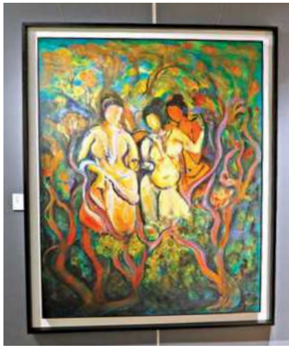
Blissful Brindabon (Acrylic on canvas)