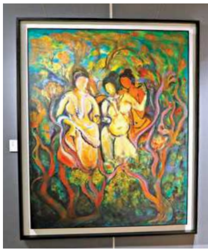
Blissful Brindaban (Acrylic on canvas)