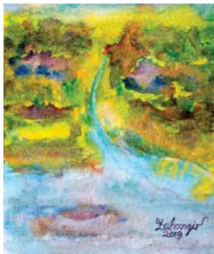
Dazzling Brahmaputra (Watercolour)