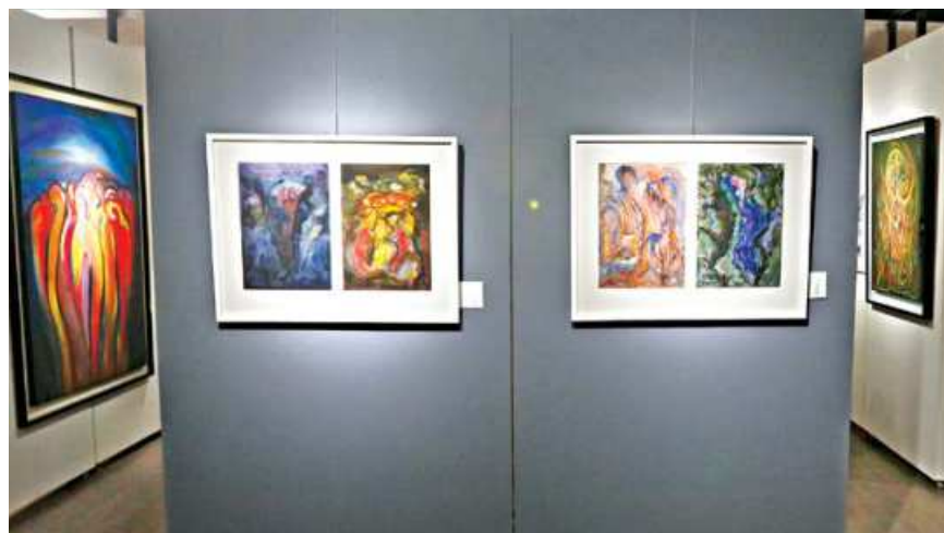
Artworks on exhibit at the event.