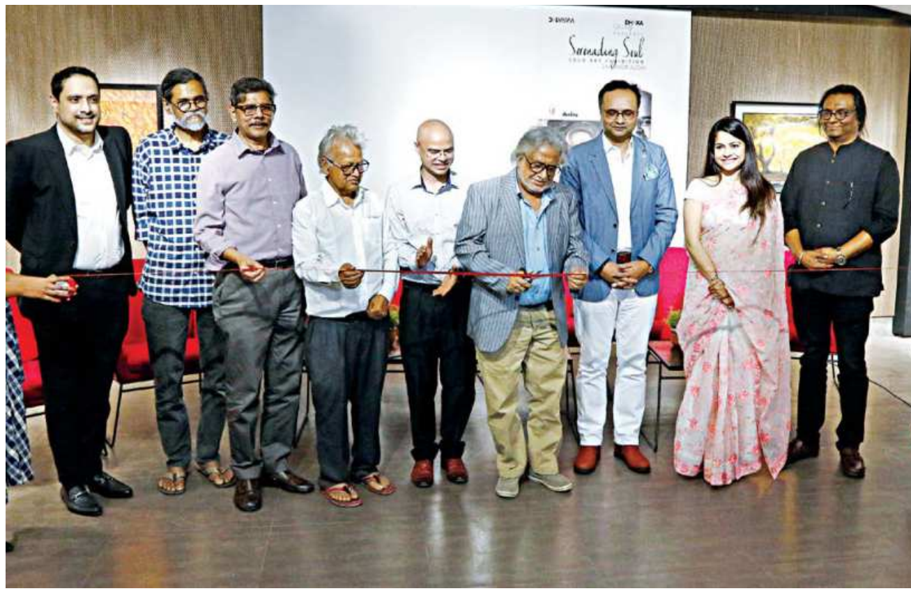
Esteemed guests at the opening ceremony.