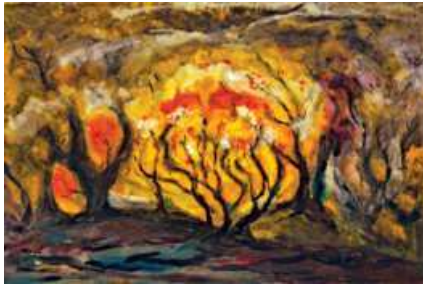
Raag Shyam Kalyan (Acrylic on canvas)