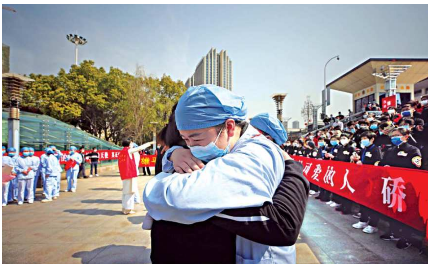
A medical worker embraces a member of a medical assistance team from Jiangsu province at a ceremony marking their departure after helping with the COVID-19 recovery effort, in Wuhan, in China's central Hubei province yesterday. Medical teams from across China began leaving Wuhan this week after the number of new coronavirus infections dropped.

She told a briefing on Monday that while China needed another month to make a final judgment, the existing prevention and control measures should be enough to bring the epidemic to an end domestically.