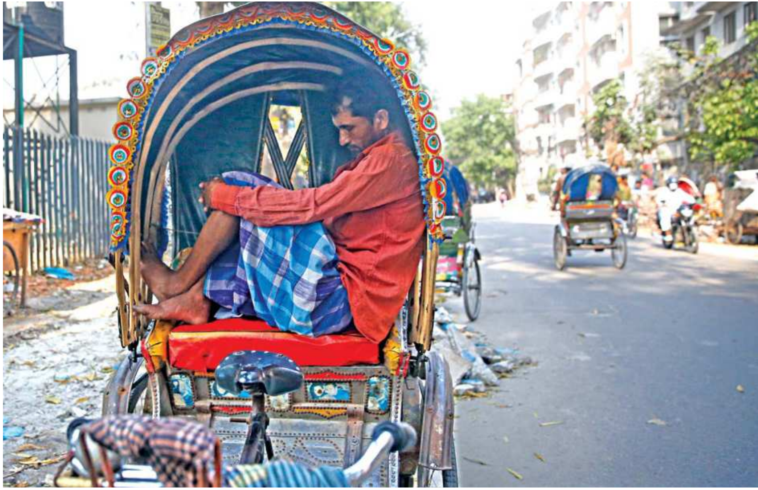
A rickshaw-puller naps inside his vehicle yesterday afternoon. Number of trips is on a steady decline with people limiting movement outside home due to coronavirus outbreak. This photo was taken in Dhanmondi.