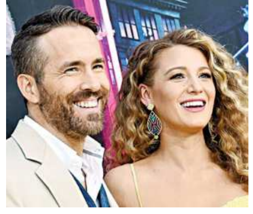
Ryan Reynolds and Blake Lively

As people and nations across the globe grapple with the coronaviru s pandemic, celebrities are stepping up to the plate to give a helping hand. The virus has affected more than 110 countries and has had an unprecedented impact, placing major cities in lockdown and implicating jobs around the world.