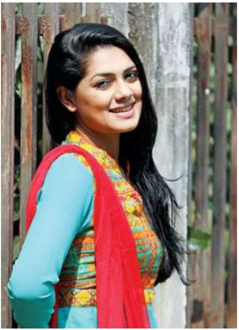
Nusrat Imrose Tisha

Despite the rising levels of fear and uncertainty, it hasn't stopped those who can, including some of the biggest stars, from speaking up about the pandemic. From acts of kindness and messages of support to major donations that will help those who are sick and at risk or out of work, here is how different artistes are making a positive impact and giving back to those in need.