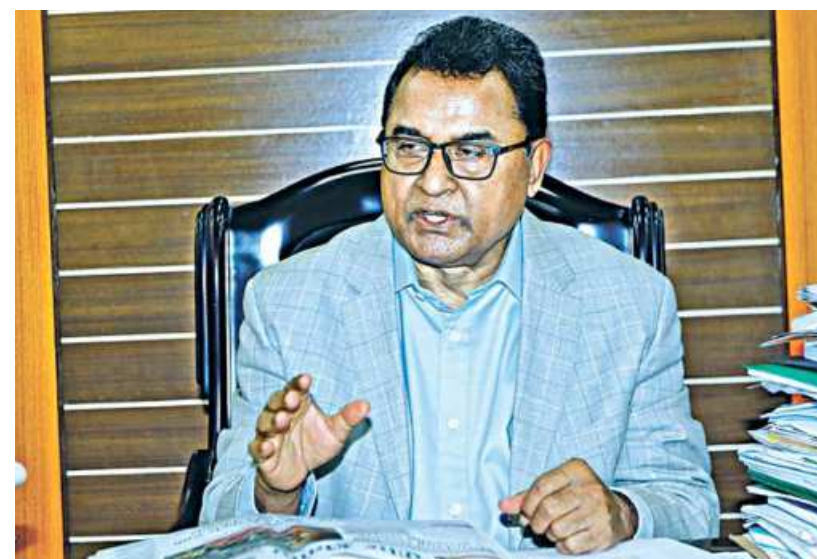
AHM Mustafa Kamal

will also give funds to us. The IMF, the World Bank, the ADB and others will give funds," said Finance Minister AHM Mustafa Kamal yesterday.