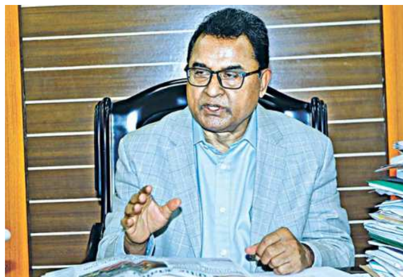
AHM Mustafa Kamal

will also give funds to us. The IMF, the World Bank, the ADB and others will give funds," said Finance Minister AHM Mustafa Kamal yesterday.