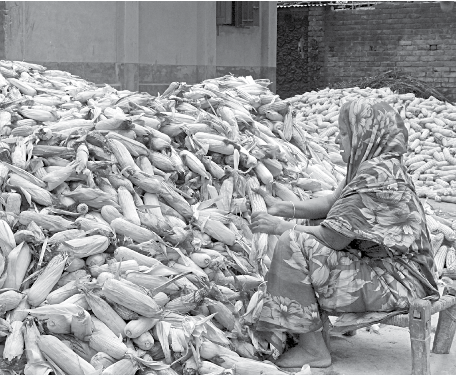
A worker removes corn husk in Kornali village of Dinajpur Sadar upazila.