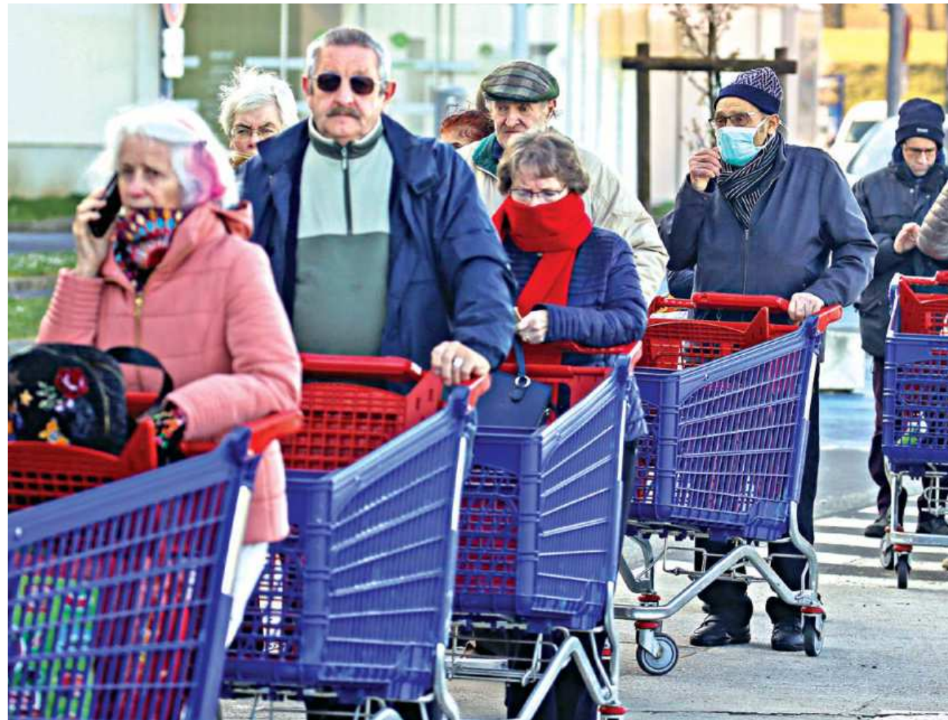
People stand in a queue to enter a Cora supermarket before a lockdown imposed to slow the rate of the coronavirus disease at midday in Cambrai, France yesterday.

Left hand of those under home quarantine will be stamped to identify them easily, said Health Minister Rajesh Tope.