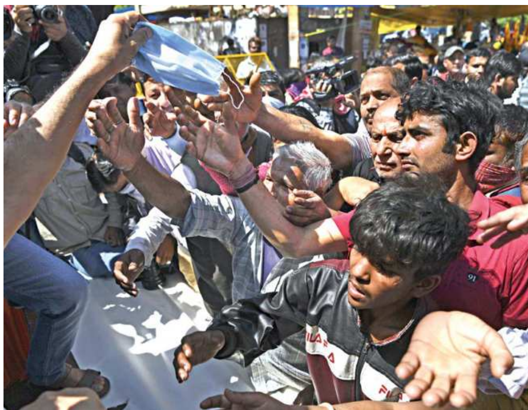
People gather to collect free facemasks distributed by Bharatiya Janata Party (BJP) workers amid concerns over the spread of COVID-19 novel coronavirus, outside a temple in New Delhi yesterday.