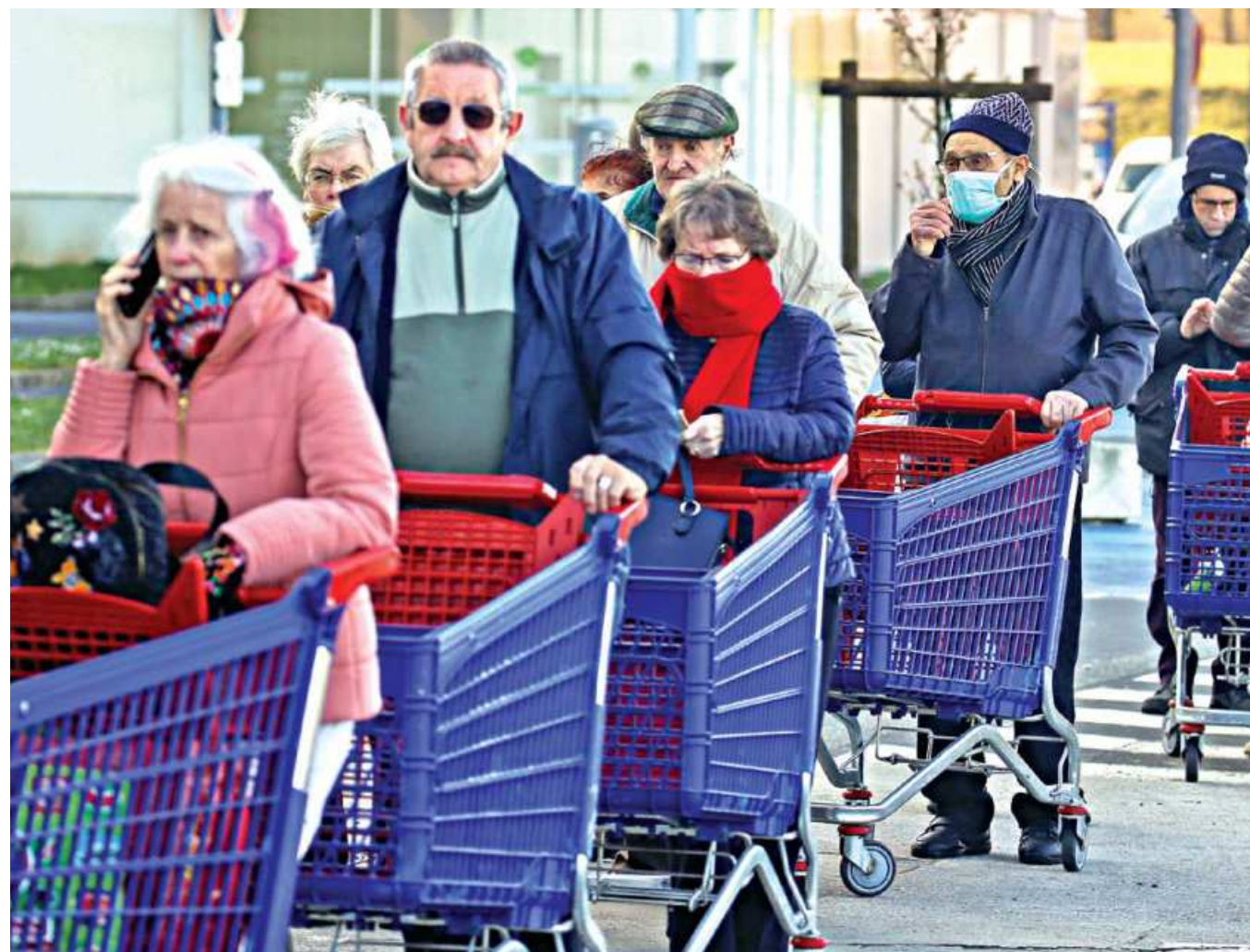
People stand in a queue to enter a Cora supermarket before a lockdown imposed to slow the rate of the coronavirus disease at midday in Cambrai, France yesterday.

Left hand of those under home quarantine will be stamped to identify them easily, said Health Minister Rajesh Tope.