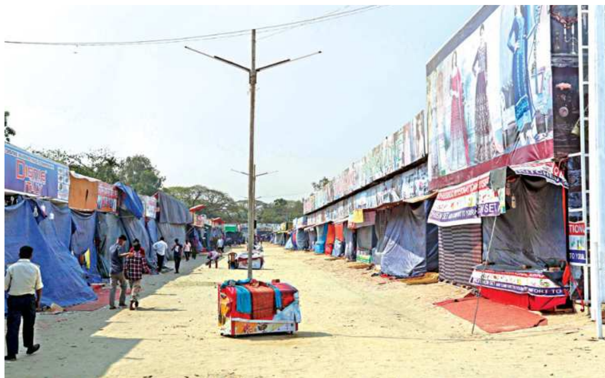
To prevent the spread of coronavirus, the month-long Chattogram International Trade Fair at port city's Railway Pologround was indefinitely postponed. This left the premises virtually deserted, with stalls remain set up but unattended. This photo was taken yesterday.