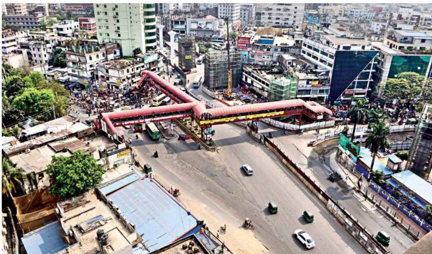
The roads of Dhaka were unusually empty yesterday, even after considering that it was a public holiday. It seems residents are resisting the urge to go out amid the spread of coronavirus, which is the right measure to take. This photo was taken from Farmgate.