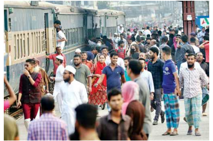
A large number of people were seen thronging bus and railway terminals yesterday. The photo was taken from Tejgaon Rail Station.

Asked about the allegations of over-charging, Mosharref said, "It is