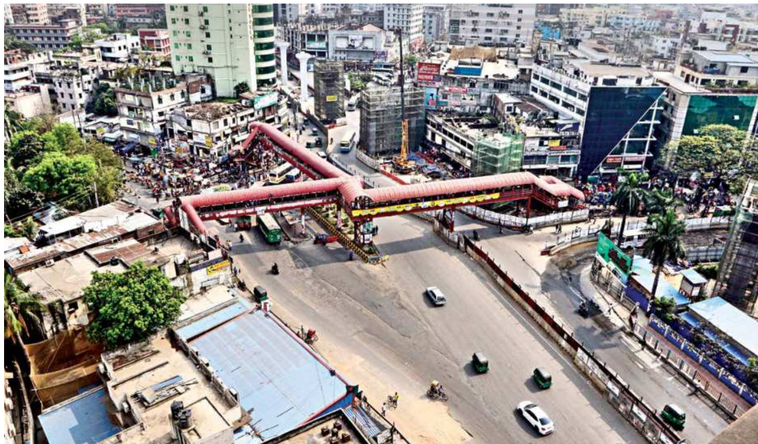
The roads of Dhaka were unusually empty yesterday, even after considering that it was a public holiday. It seems residents are resisting the urge to go out amid the spread of coronavirus, which is the right measure to take. This photo was taken from Farmgate.