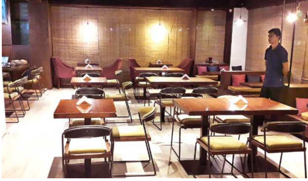
Empty restaurant seats depict the scare coronavirus currently has on Dhaka. The photo was taken on Monday evening.