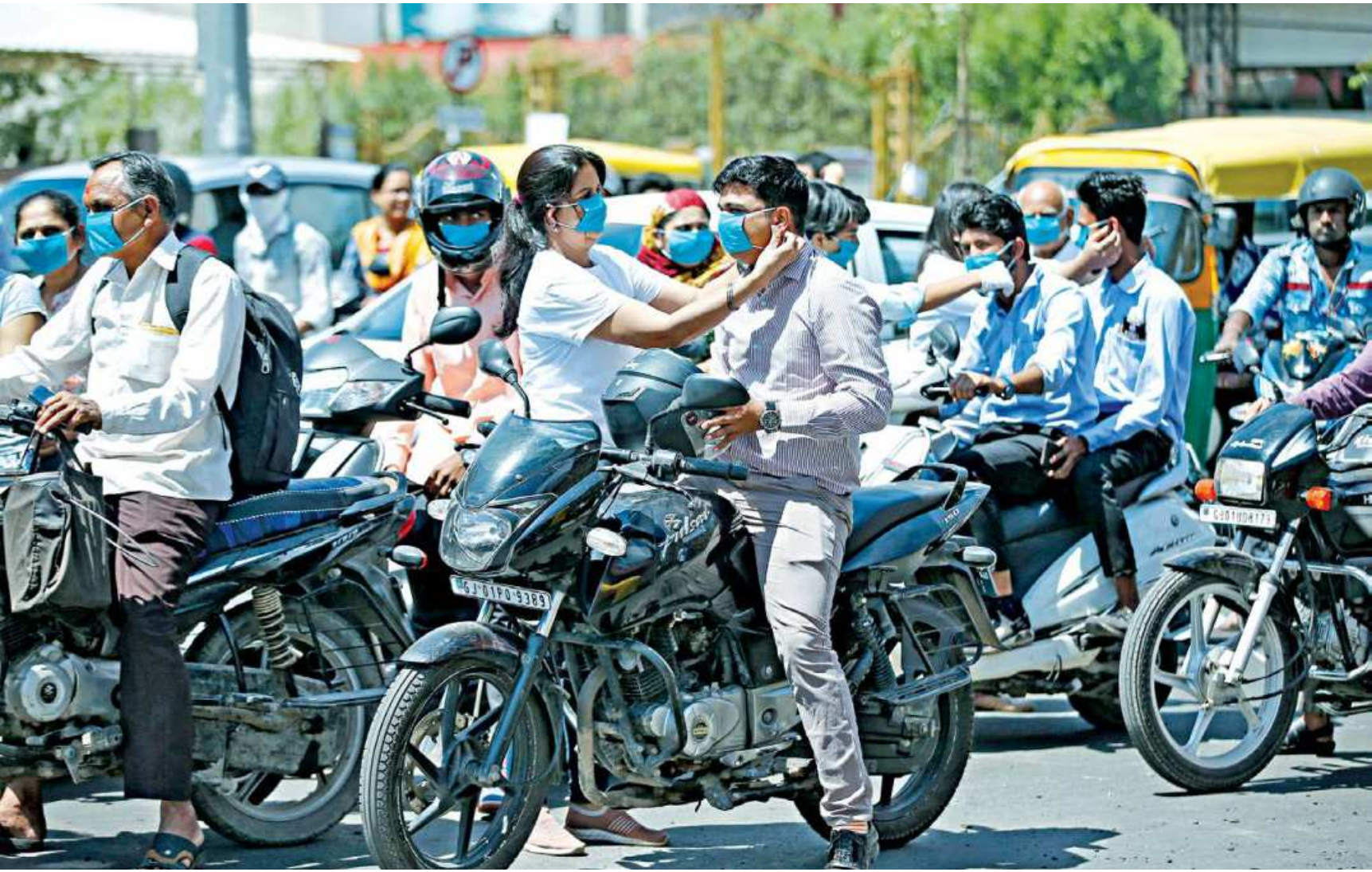
A member of a non-governmental organisation puts a face mask on a man as a precaution against the spread of coronavirus, at a traffic junction in Ahmedabad, India yesterday.

The total number of confirmed COVID-19 cases across India is 116, with maximum cases recorded in Maharashtra (37). The only other death has been reported in Karnataka.