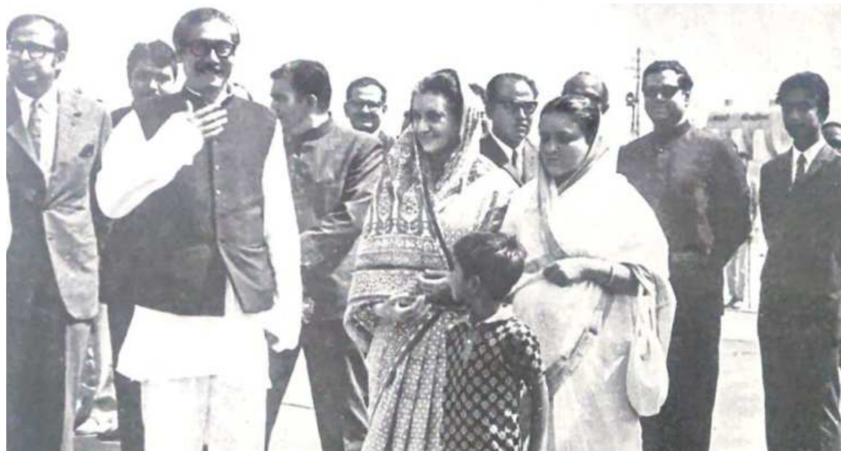
Bangabandhu Sheikh Mujibur Rahman, Sheikh Fazilatunnesa Mujib and their youngest son Sheikh Russel with Indian Prime Minister Indira Gandhi during her visit to Bangladesh on March 17, 1972.

ধুলো ময়লার সুপ্রিম সসাধন BERGER Weather Coat ANTIDIRT SUPREME