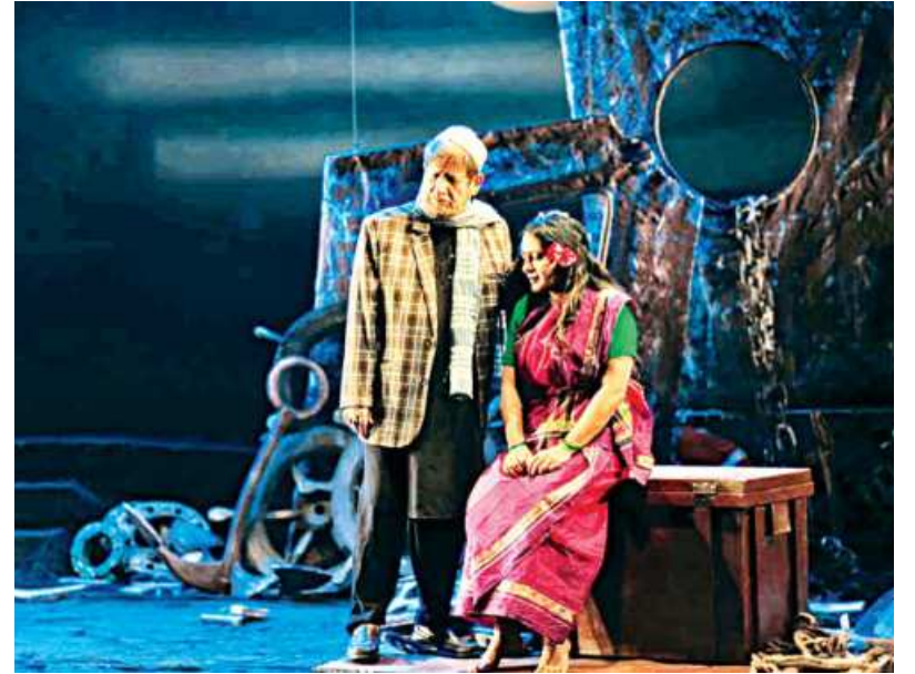
Kalo Joler Kabbo