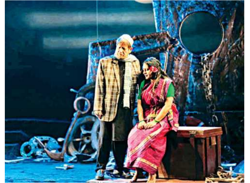
Kalo Joler Kabbo