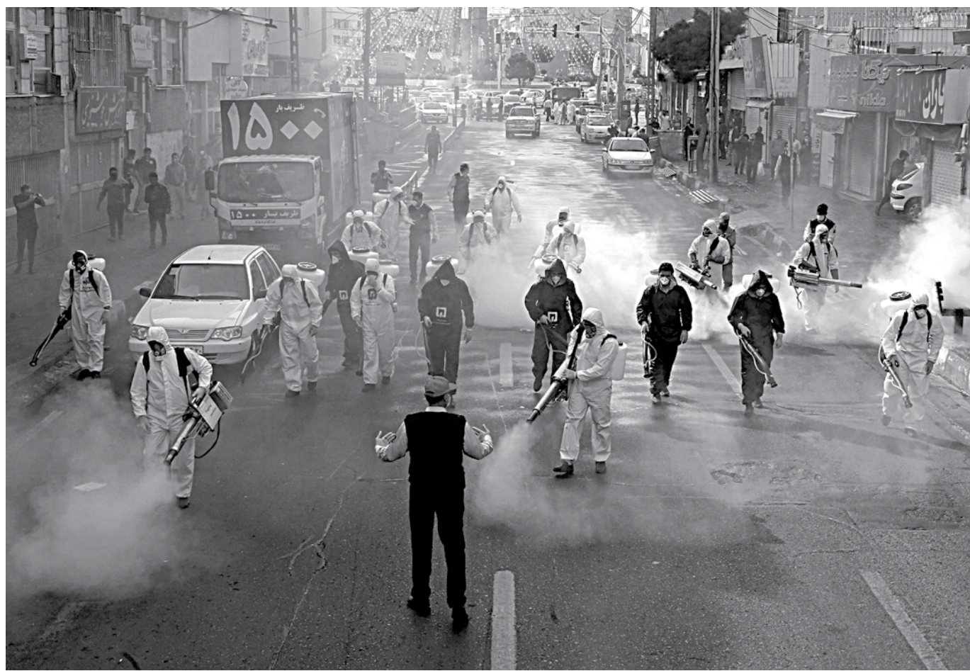
Iranian firefighters disinfect streets in the capital Tehran in a bid to halt the wild spread of coronavirus, yesterday. Iranian forces will clear the streets nationwide within 24 hours and all citizens will be checked for the new coronavirus in a bid to halt its spread, the military said.