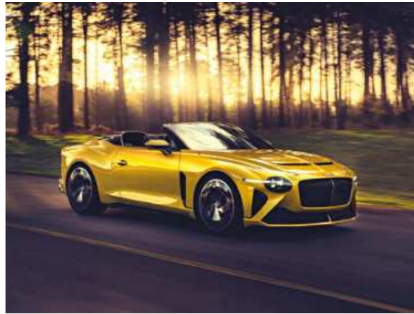
The Bentley Mulliner Bacalar is a hand-built bespoke Grand Tourer with a W12 engine developing 650 HP and 667 lb ft of torque. They are only making 12 of them, one can be yours for 1.9 million USD.