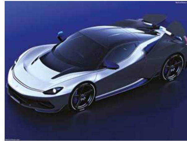
The Pininfarina Battista Anniversario is an even more limited edition of an already limited supercar. They are only making five. Half a million USD for 10kg of weight reduction over the normal car.