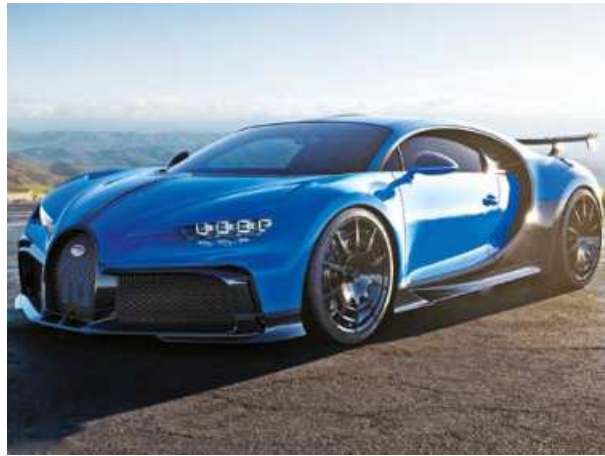
Bugatti's Chiron Pur Sport emphasizes aerodynamics, weight reduction, and power distribution. Dose this mean more people will take them to the track? Unlikely.