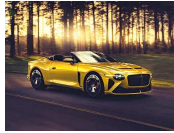
The Bentley Mulliner Bacalar is a hand-built bespoke Grand Tourer with a W12 engine developing 650 HP and 667 lb ft of torque. They are only making 12 of them, one can be yours for 1.9 million USD.