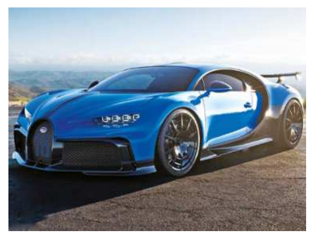
Bugatti's Chiron Pur Sport emphasizes aerodynamics, weight reduction, and power distribution. Dose this mean more people will take them to the track? Unlikely.