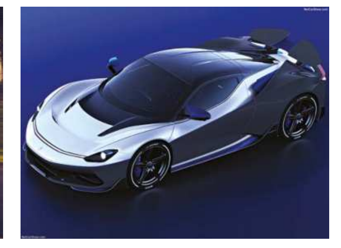
The Pininfarina Battista Anniversario is an even more limited edition of an already limited supercar. They are only making five. Half a million USD for 10kg of weight reduction over the normal car.