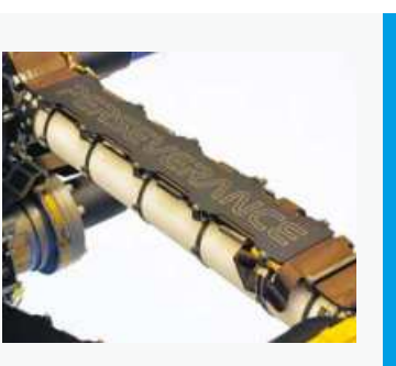
Mars 2020 rover has a new name: Perseverance.

Short-form video service Quibi will launch on April 6 with 50 new shows.