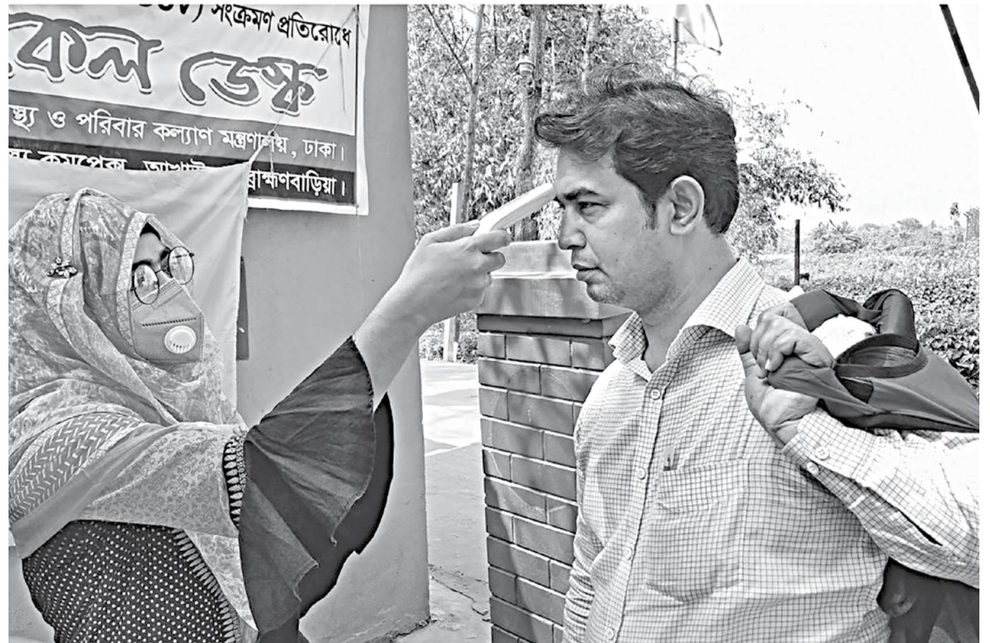
A health worker scans a homebound passenger for signs of fever at a medical desk set up by the Brahmanbaria civil surgeon's office at Akhaura Land Port, on March 10, 2020.

The COVID-19 virus is known to spread through tiny droplets ejected by affected people when they sneeze—anyone coming in contact with such