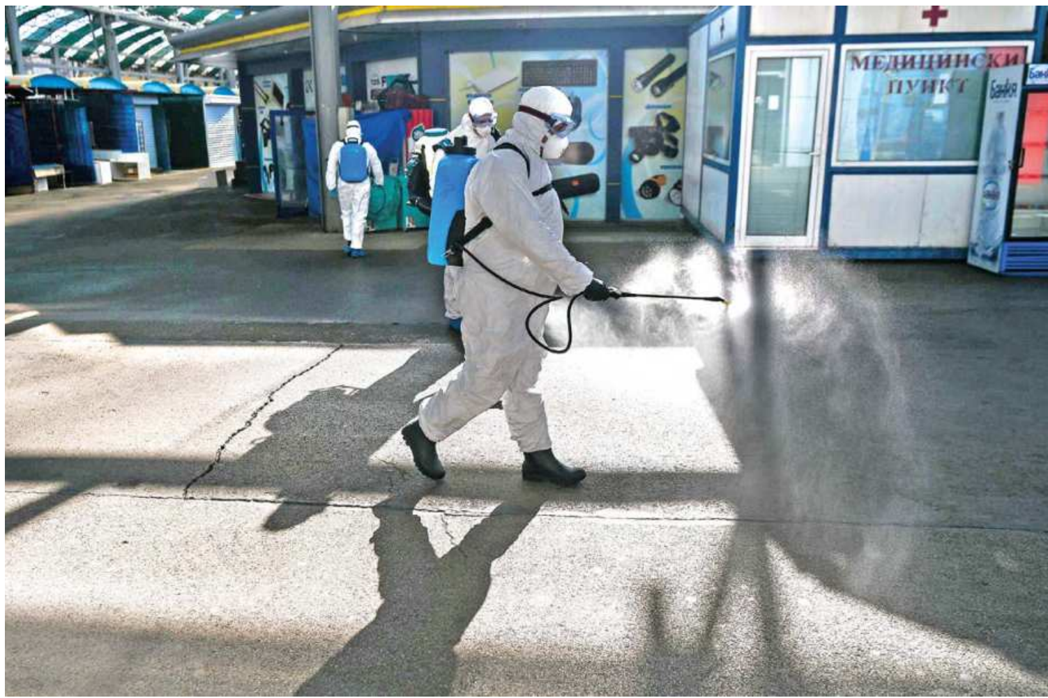
Members of Sofia's Municipality disinfect the biggest market for Chinese goods in Sofia, Bulgaria to prevent the spread of novel coronavirus yesterday.

The total number of cases recorded in mainland China was 80,793. As of Tuesday, 62,793 people had recovered and been discharged from hospital, or nearly 80 percent of the infections.