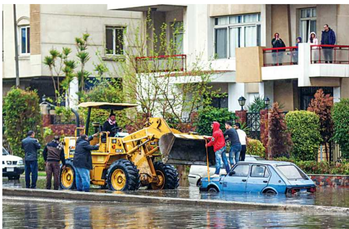
People use a bulldozer to pull out an inundated car from a flooded street in the New Cairo suburb of the Egyptian capital yesterday amidst a heavy rain storm.

Before the strike near the border town of Albu Kamal, rockets were fired at a military base north of Baghdad hosting coalition troops, killing two Americans and one Briton.