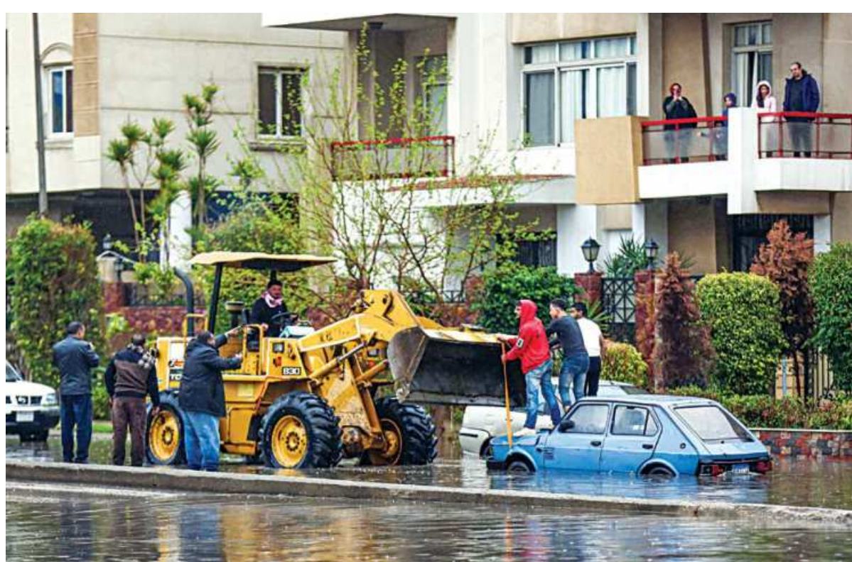
People use a bulldozer to pull out an inundated car from a flooded street in the New Cairo suburb of the Egyptian capital yesterday amidst a heavy rain storm.

Before the strike near the border town of Albu Kamal, rockets were fired at a military base north of Baghdad hosting coalition troops, killing two Americans and one Briton.