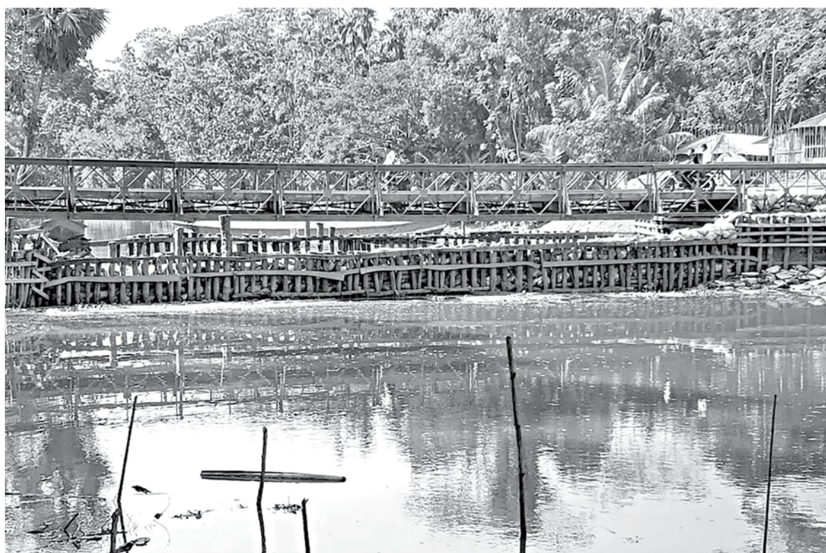
A group of local people build an illegal dam in Varani Khal of Barishal's Bakerganj upazila to stop erosion by river.

They will take steps to free the canal immediately, said the assistant commissioner.