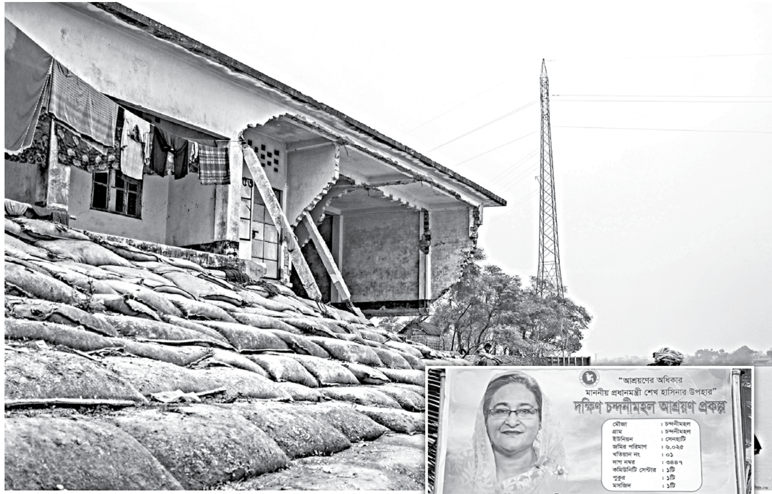
Geotextile sand bags were dumped on the Atai river bank where a barrack of 'Dokkhin Chandonimahal Ashrayan Prokolpo', Inset , a government housing project for the landless in Digholia upazila of Khulna, was damaged due to erosion.