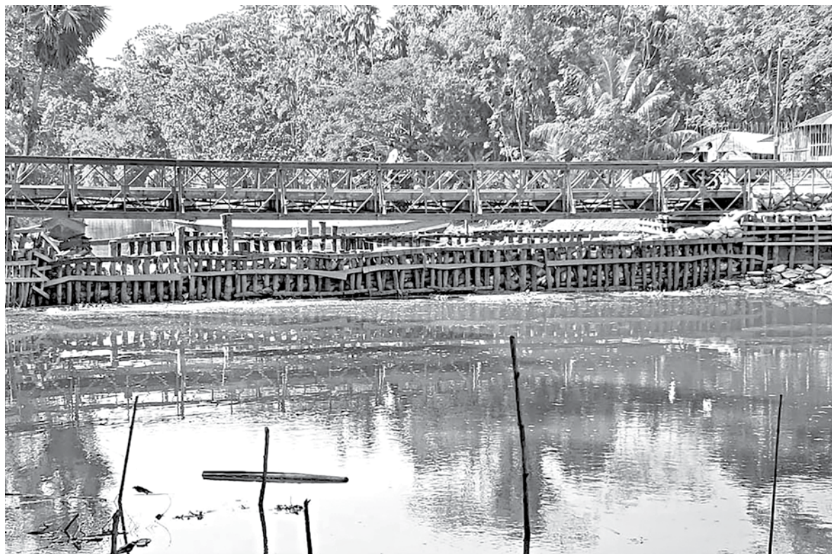
A group of local people build an illegal dam in Varani Khal of Barishal's Bakerganj upazila to stop erosion by river.

They will take steps to free the canal immediately, said the assistant commissioner.