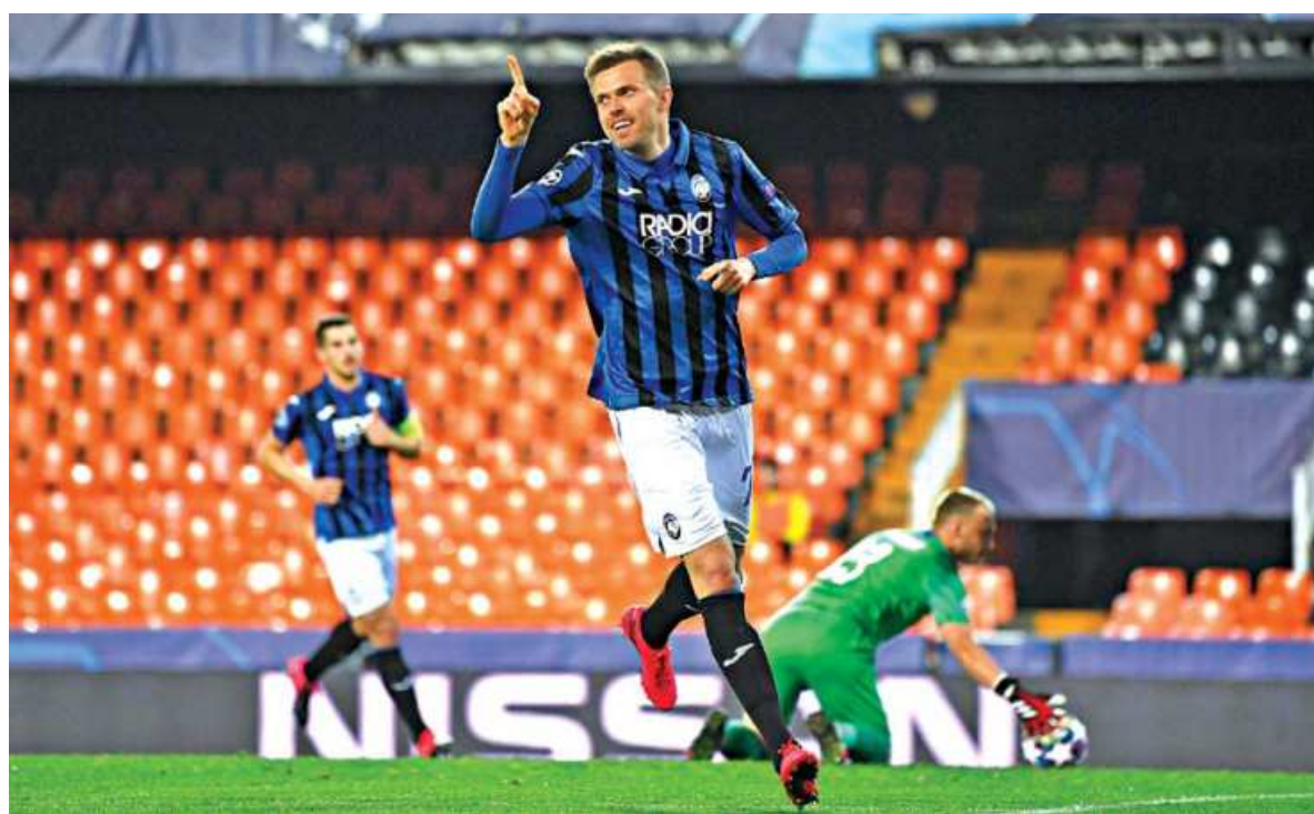
Atalanta's Slovenian striker Josip Ilicic scored four goals as the Italian debutants beat Valencia 4-3 in a closed-doors Champions League fixture at the Mestalla on Wednesday to progress 8-4 on aggregate.

The 12th edition of the professional league is currently being held at seven venues and the sixth round of fixtures are scheduled to get underway today when Sheikh Jamal take on Sheikh Russel while Arambagh play against Saif SC at the BNS.