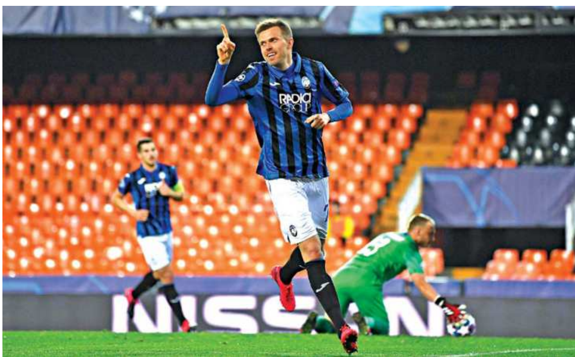
Atalanta's Slovenian striker Josip Ilicic scored four goals as the Italian debutants beat Valencia 4-3 in a closed-doors Champions League fixture at the Mestalla on Wednesday to progress 8-4 on aggregate.

The 12th edition of the professional league is currently being held at seven venues and the sixth round of fixtures are scheduled to get underway today when Sheikh Jamal take on Sheikh Russel while Arambagh play against Saif SC at the BNS.