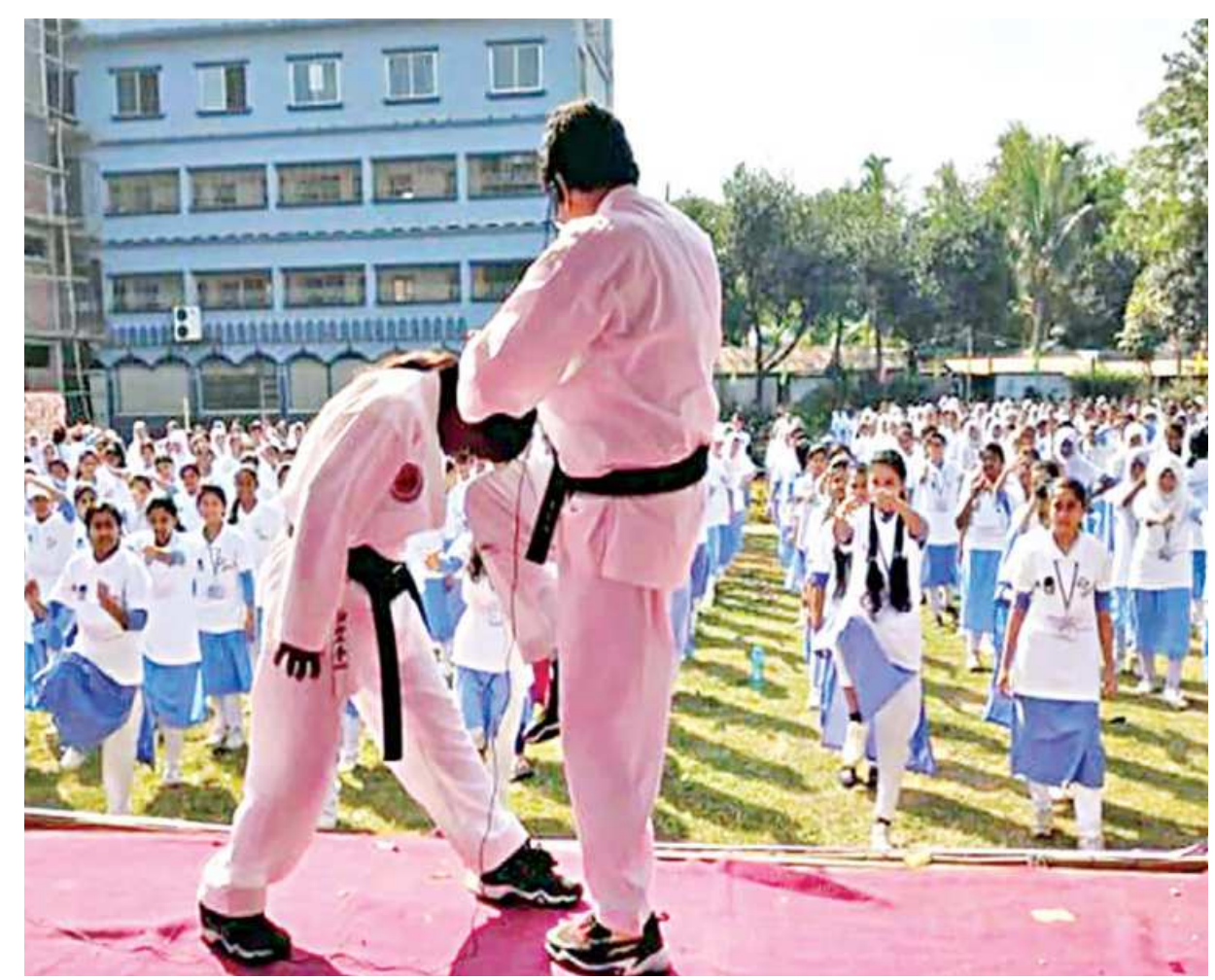
School and college girls are learning karate for self-defense at Rafiqul Islam Mohila College campus in Bhairab of Kishoreganj.