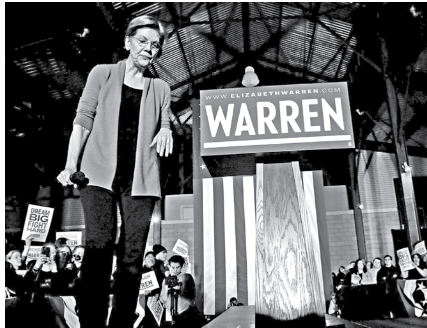
Sen Elizabeth Warren, who dropped out of the 2020 Democratic presidential race, represents a missed opportunity for America to elect a woman president.

Interestingly, a journalist even asked her about her glowing complexion even at 70, and she unabashedly answered that she used Pond's moisturizer. A simple, old-fashioned beauty tip, offered so willingly by the woman who