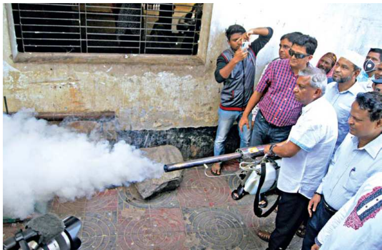
Sylhet city Mayor Ariful Haque Chowdhury fires mosquito repellent from a fogger to inaugurate a cleanliness drive across the city.