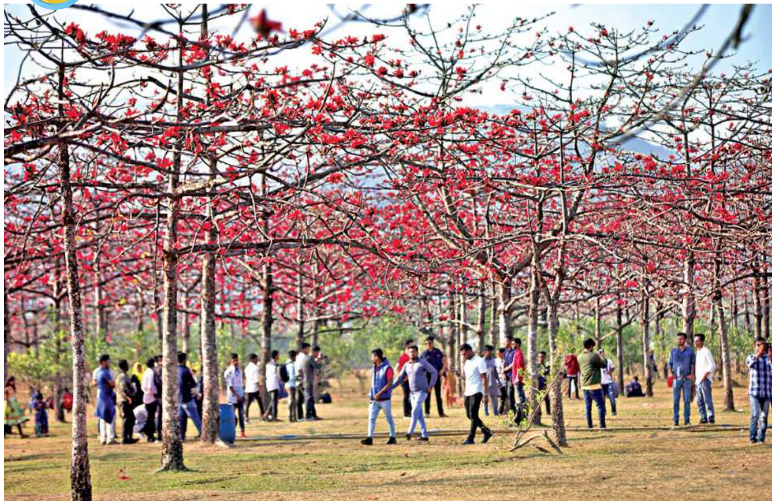
One of the lesser known attractions of spring lies in Sunamganj's Tahirpur upazila, near the banks of the Jadukata river. For the last seven or eight years, a cotton tree garden in the area has become quite the tourist spot. Started by former UP chairman Joyanal Abedin when he planted 3,000 seedlings across a 100 bigha land, the garden was later bequeathed another 4,000, with a total of 3,400 bearing flowers this season. That Sunamganj boasts visitor sites such as Barik Tila, Meghalaya Hills, Tanguar Haor only helps attract more people to the garden. This photo was taken on Friday.