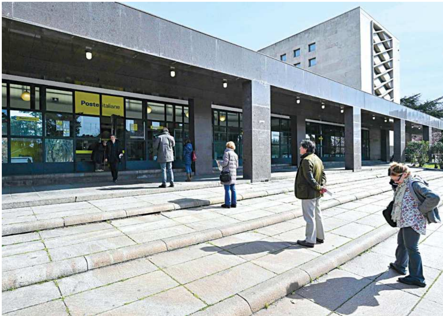
People keep a safe distance as part of precautionary measures against the spread of the novel coronavirus, while lining up to enter a post office in downtown Rome yesterday.