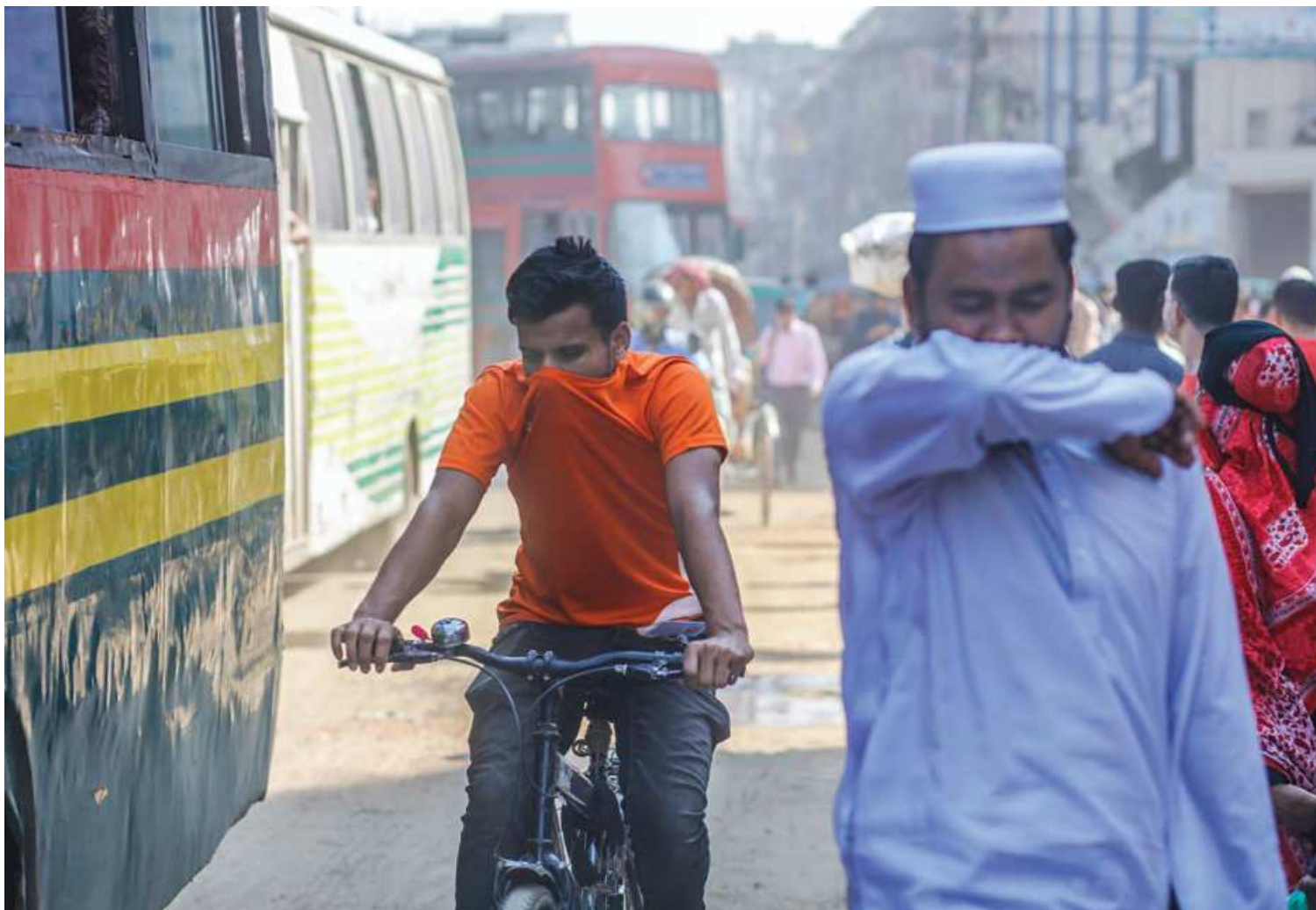
Two men cover their nose to avoid breathing polluted air near Bangabandhu Avenue in the capital yesterday. A part of the road was dug up for laying cables and sewer pipes underground. Air pollution remains a serious threat to public health in the city as Dhaka's air quality was ranked the third worst in the world in the Air Quality Index yesterday morning.