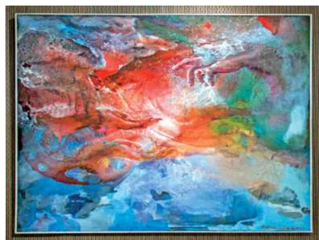
Paintings on exhibit at the event.