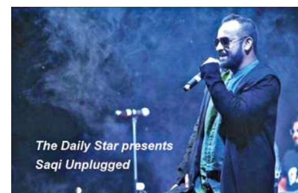
The Daily Star presents Saqi Unplugged

Due to safety issues and concerns over the recent Coronavirus, the show is postponed for the time being. The rescheduled date and time will be announced soon.