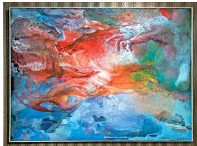
Paintings on exhibit at the event.