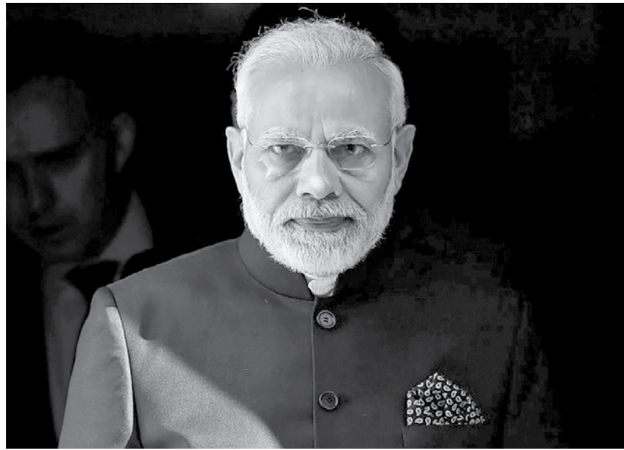
Indian Prime Minister Narendra Modi.

in its north eastern states, but in tandem first with Manmohan Singh as prime minister of a Congress-led dispensation and then with Modi helming a BJP-led government. Hasina and Modi have invested heavily in the relationship—politically and economically—over the last decade or so. The divergent ideological colours of Awami League and Bharatiya Janata Party have not been allowed to come in the way of burgeoning ties. This showed as much of the bipartisan support Prime Minister Sheikh Hasina enjoys in India as her own ability to not allow the ties to be bedevilled by the traditional perception about the BJP in Bangladesh. Also, Sheikh Hasina has not allowed the ties to be stuck by the unresolved Teesta river water-sharing issue which is of immense importance to vast swathes of Bangladesh. No less significant was Modi, who worked past his party’s long-held opposition to any swap of territories with Bangladesh to help secure parliamentary nod to implement the landmark land boundary agreement (LBA) in 2015, resolving one of the major irritants in bilateral relations. Many in India had at that time attributed BJP’s about-turn on LBA to Modi’s penchant for springing surprises when it comes to foreign policy. But behind that lies India’s long-term