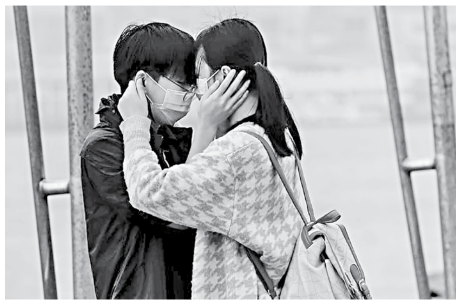
A couple wears masks as they embrace, following the outbreak of the novel coronavirus on Valentine's Day in Hong Kong, February 14.