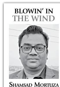
BLOWN' IN THE WIND