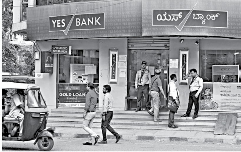
Customers make enquiries with the security personnel at a Yes Bank branch in Bangalore on March 6.