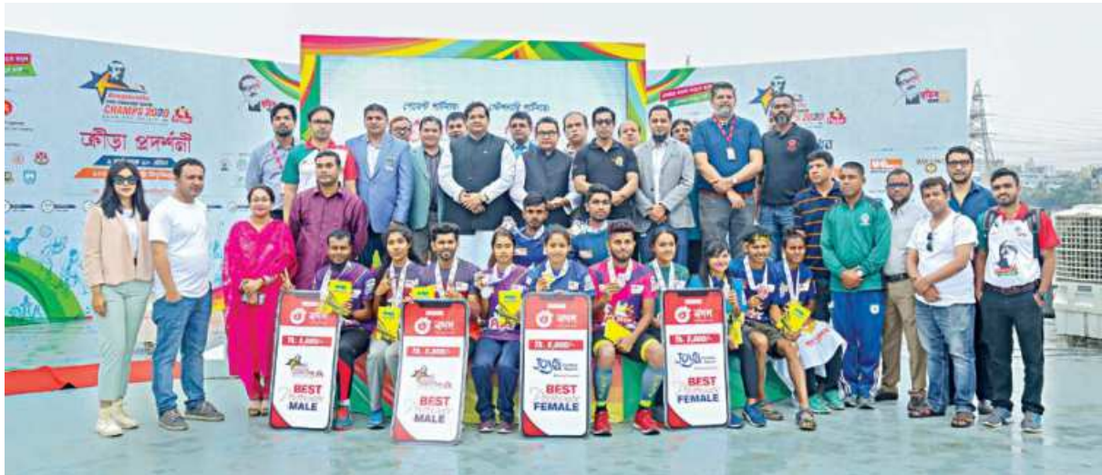
Finance Minister AHM Mustafa Kamal and State Minister for Youth and Sports Zahid Ahsan Russel were among the guests during the inauguration of the Bangabandhu Sports Championship at Hatirjheel in the capital yesterday.