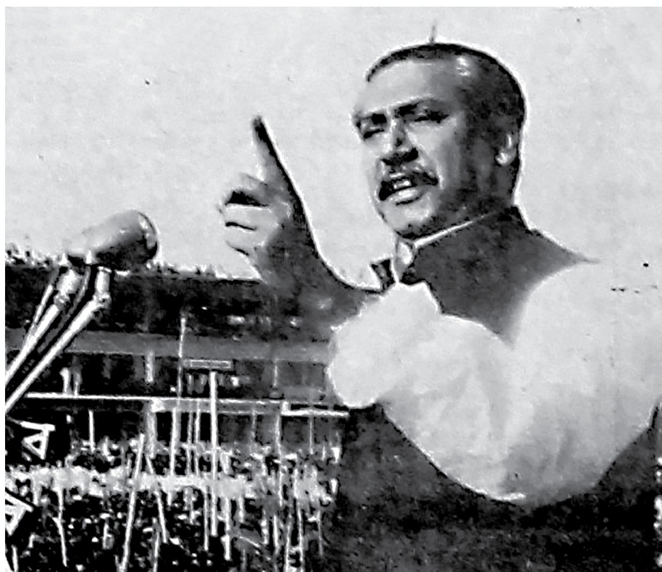
Bangabandhu Sheikh Mujibur Rahman addressing a rally at Paltan Maidan on March 3, 1971.

Bangabandhu refused General Yahya Khan's invitation to a meeting of political leaders on March 10, by calling it a "cruel joke." A pivotal decision was made to rename "Radio Pakistan" as "Dhaka Betar," which changed the game for Bengal's media. Officers and employees of all radio centres in Dhaka had taken this decision collectively, and now the radio station broadcasted directives by AL, alongside patriotic songs by Kazi Nazrul Islam and Rabindranath Tagore. The agenda for the day included the strike from 6 am to 2 pm, with a procession and gayebi janaza scheduled for 12 pm. Bangabandhu had his people's best interest in mind, and so urged the offices to remain open for the next two days to allow employees to collect their salaries, but still called for strikes on the fifth and sixth of the month. The Non-Cooperation Movement announced by Bangabandhu was in full swing.