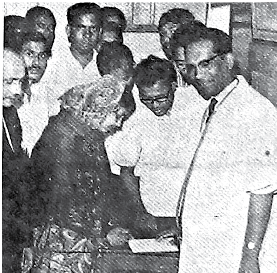
Lines formed at blood banks for donation of blood for the injured protesters after Bangabandhu's request on March 4, 1971.