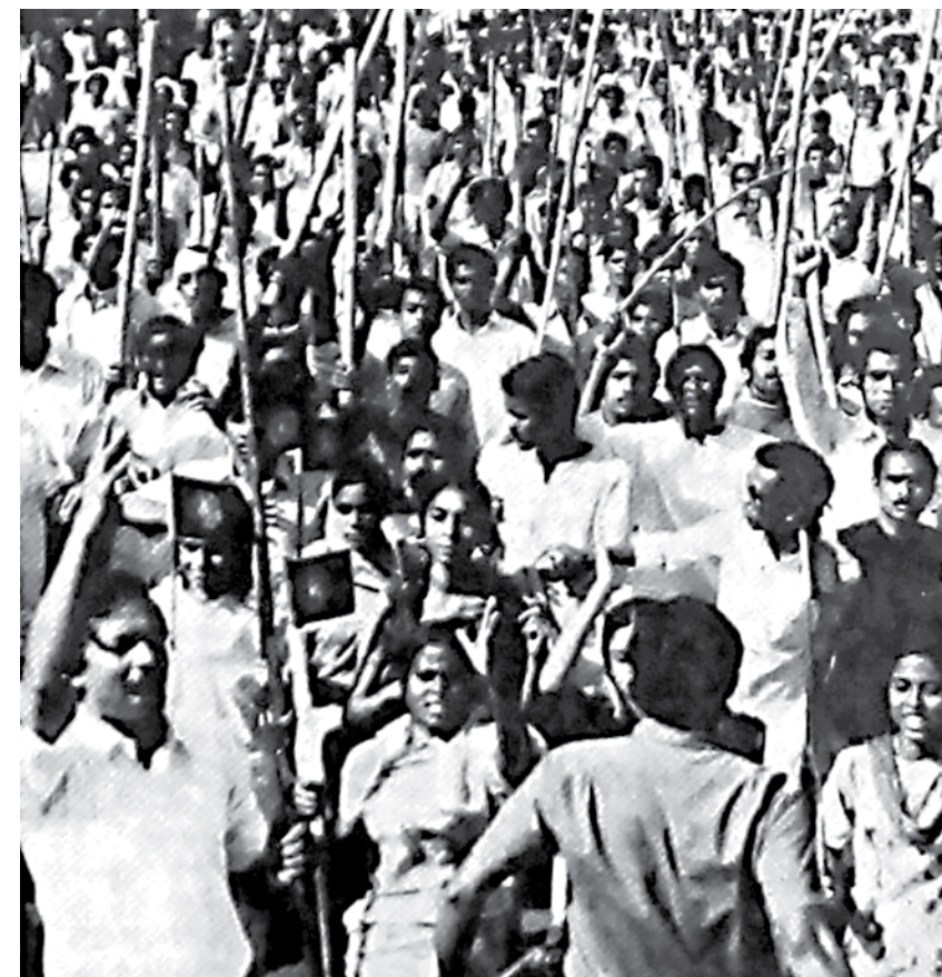
Mourning procession by Chhatra League for protesters killed at Tongi on March 5, 1971.