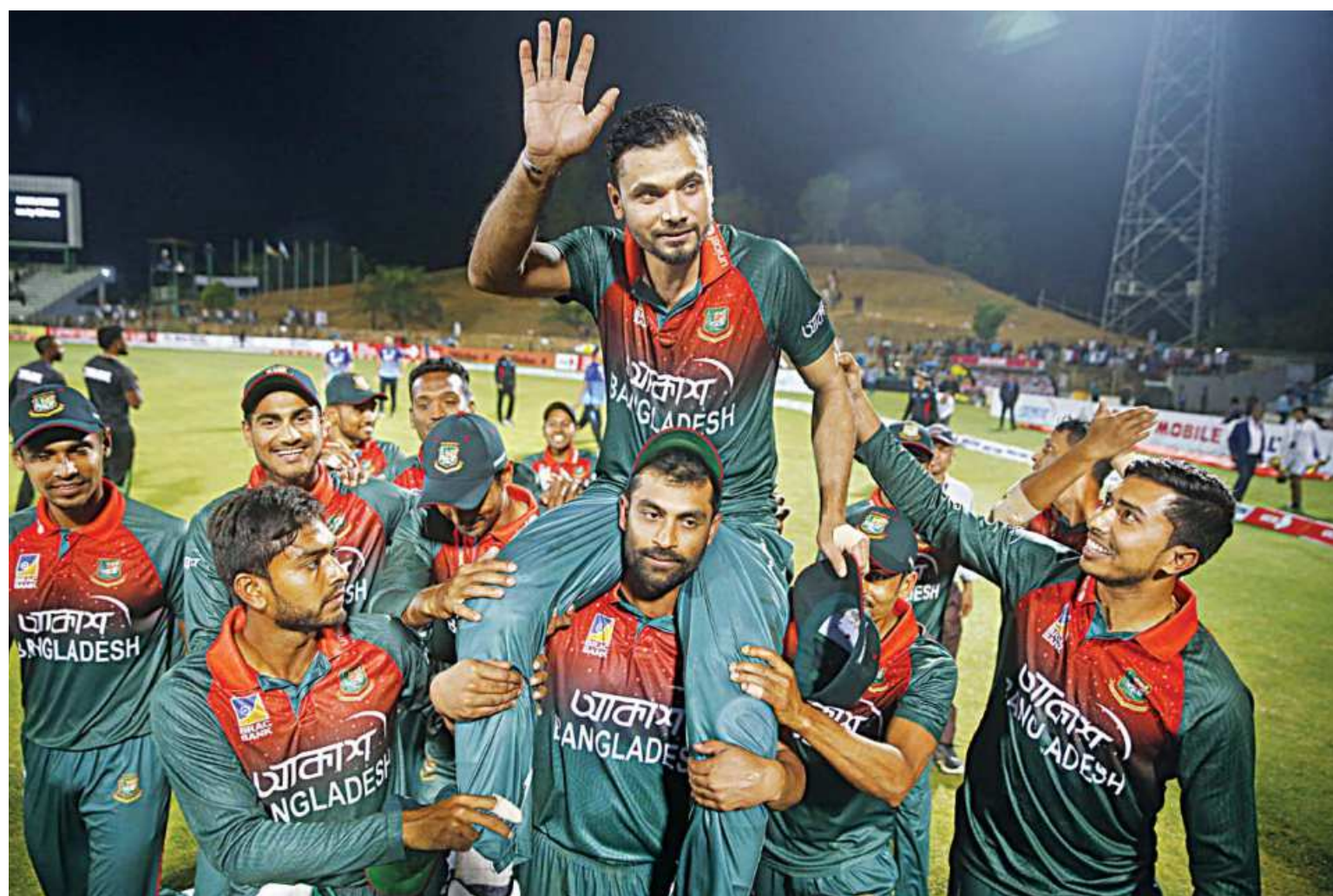
Tamim Iqbal carries the man who bore the burden of Bangladesh cricket since 2015 as the Tigers celebrated Mashrafe Bin Mortaza's last match as captain by winning the third ODI against Zimbabwe by 123 runs in Sylhet yesterday.