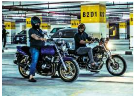
Real bikes like these don't go "pot-pot-pot"