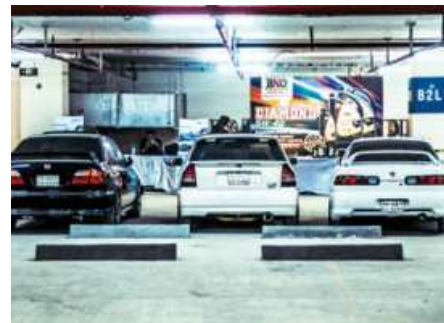
3 butts for all kinds of loving: sedan, hatch and liftback