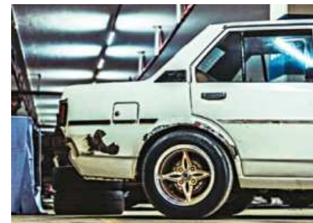
All people are pink inside and all cars are rusty brown underneath