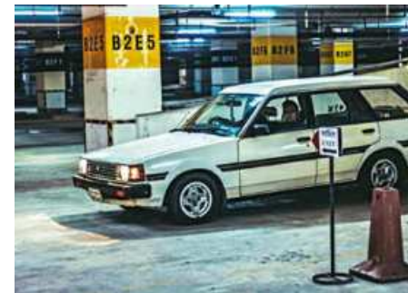
These 80's Corolla wagons came with faux wood panelling on the outside disappointing many termite generations