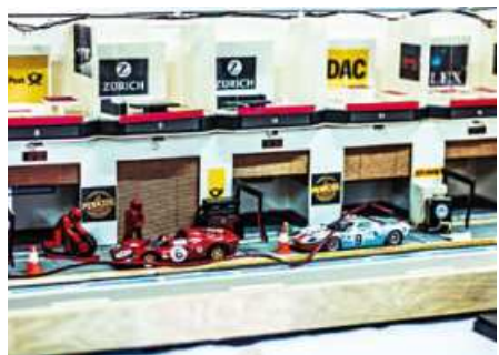
1:43 scale diorama celebration of Ford's greatest Victory against Ferrari