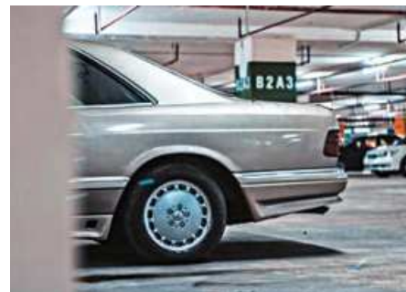
Hate it or really, really love it like (80's rock-stars love cocaine): Mercedes 500 SEC lives on with a Toyota heart