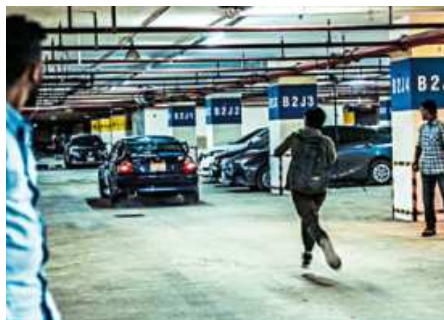
Man sees Evo, starts performing ballet out of joy