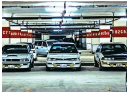
Gloria Gaynor referred to these 90's Corollas in 1978 when she sang "I will survive"