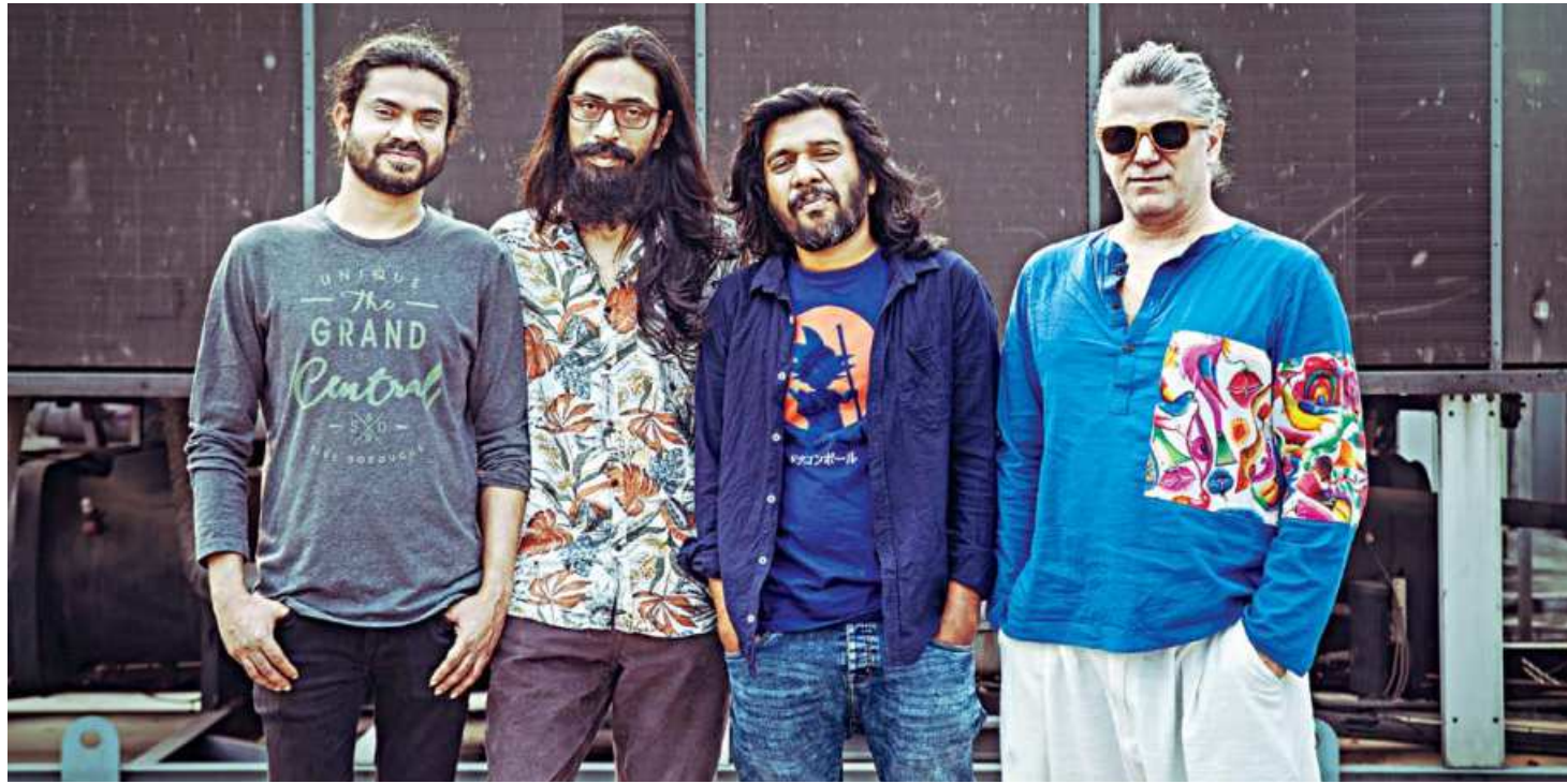
Shonar Bangla Circus.

As afternoon turned to evening in my chat with Shonar Bangla Circus, it was evident that they had put their heart and soul into their debut album, 'Hyena Express'. An amalgamation of nine spine-chilling tracks, including 'Mrittui Utpadon Karkhana', 'Ondho Deyal', 'Amar Naam Oshukh' and 'Kromosho', it tells the story of how the human race cornered itself into hopelessness. Even though the album is inherently musical, it reads like a postmodern book, across the tracks.