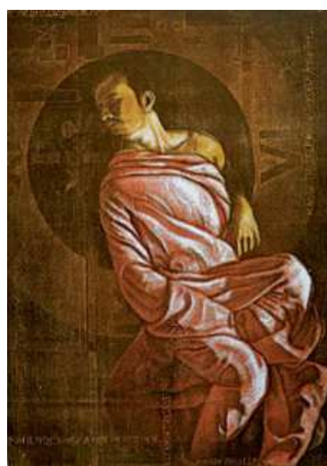
Artworks from the exhibition.