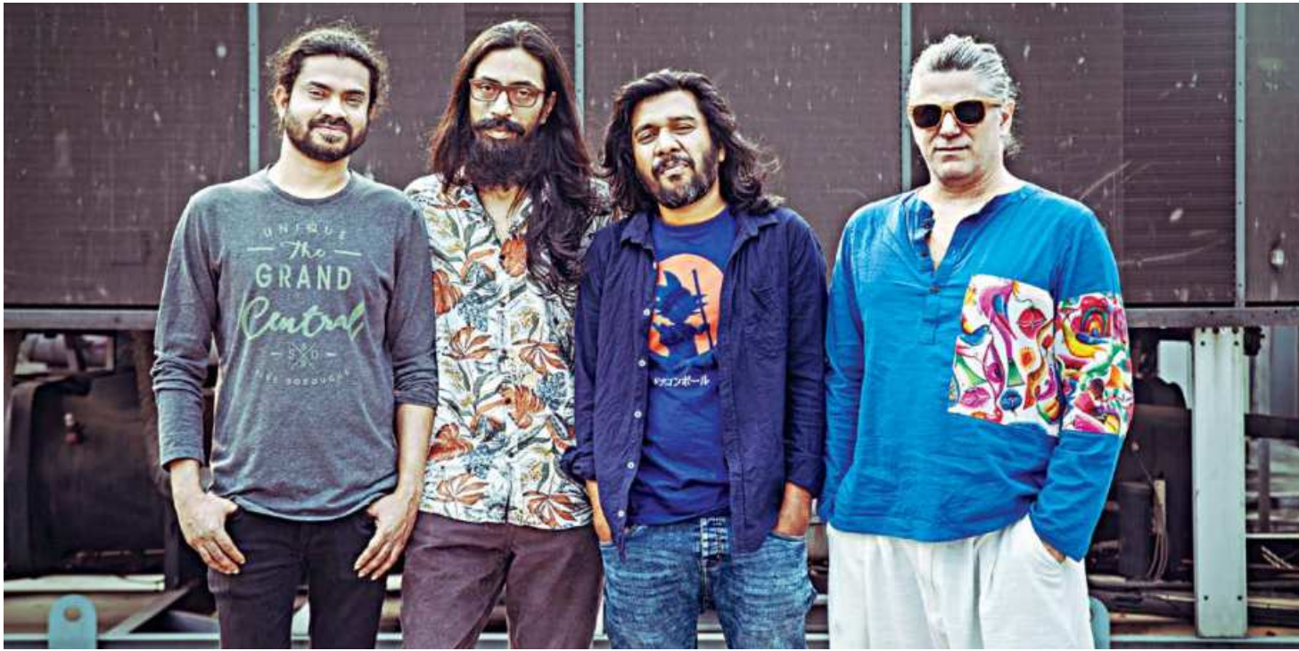
Shonar Bangla Circus.

As afternoon turned to evening in my chat with Shonar Bangla Circus, it was evident that they had put their heart and soul into their debut album, 'Hyena Express'. An amalgamation of nine spine-chilling tracks, including 'Mrittui Utpadon Karkhana', 'Ondho Deyal', 'Amar Naam Oshukh' and 'Kromosho', it tells the story of how the human race cornered itself into hopelessness. Even though the album is inherently musical, it reads like a postmodern book, across the tracks.