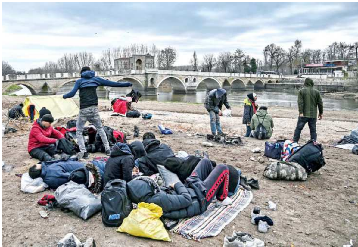
Migrant families gather near the Tunca river waiting to resume their efforts to enter Europe near the Pazarkule border gate in the city of Edirne, northwest Turkey, yesterday.

The ministers also strongly backed fellow member Greece, despite the United Nations refugee agency warning that Greece's suspension of asylum claims has no legal basis.