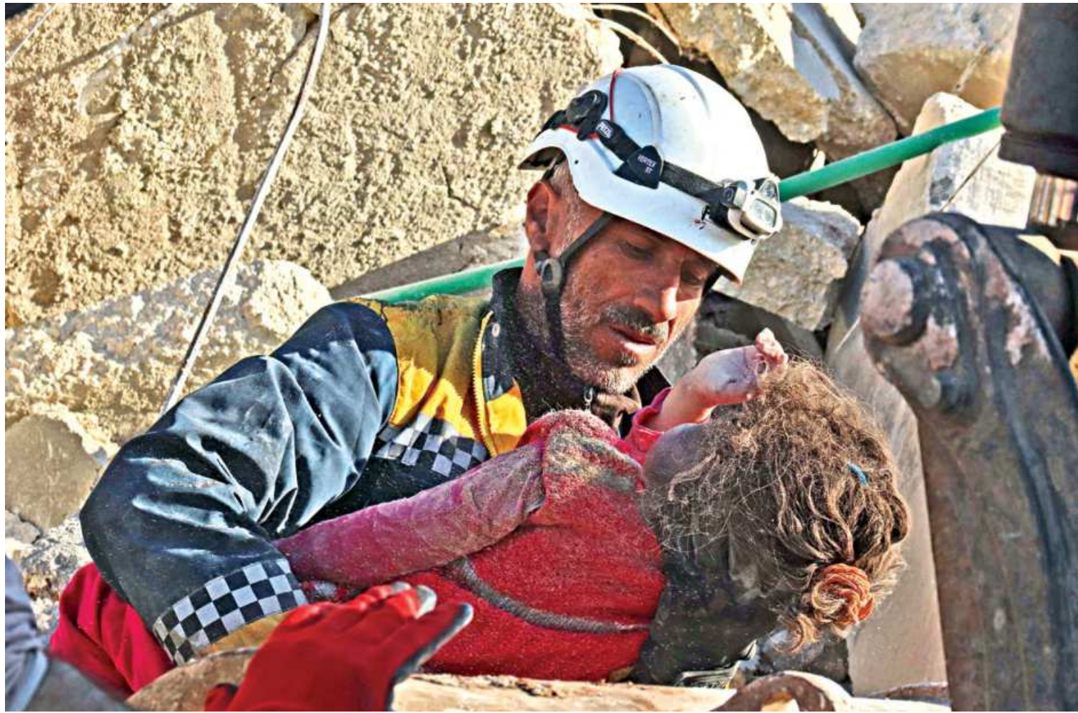
A member of the Syrian Civil Defence, also known as the "White Helmets", carries a child after she was recovered from debris in the town of Maaret Misrin following Syrian government forces airstrikes yesterday in Syria's northwestern Idlib province.

The patient whose room was sampled before cleaning had the mildest symptoms of the three, only experiencing a cough. The other two had moderate symptoms: both had coughing and fever, one experienced shortness of breath and the other was coughing up mucus.