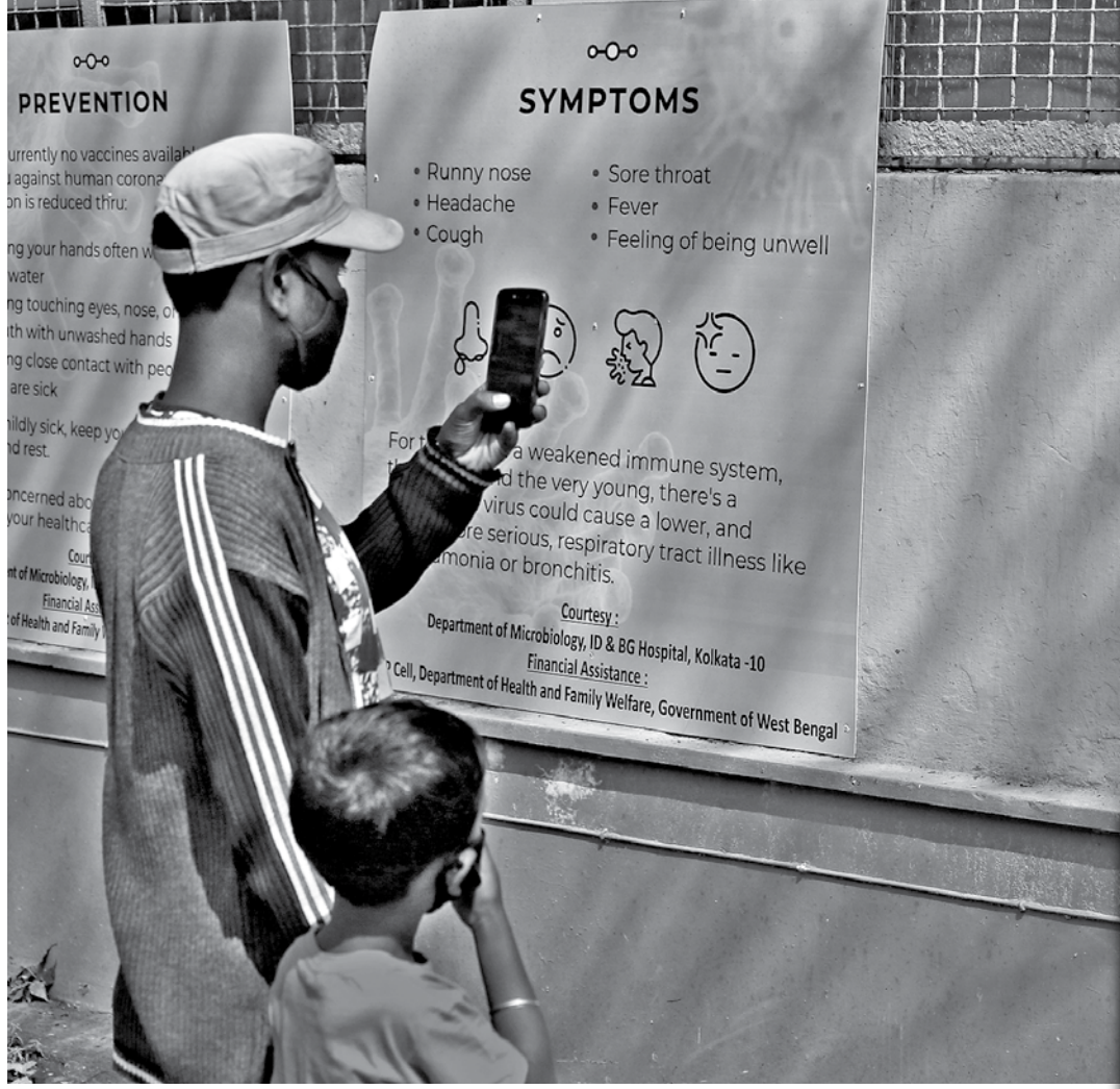
A man uses his mobile phone to take photographs of posters carrying messages on symptoms of coronavirus disease inside hospital premises in Kolkata, India yesterday. Inset , students sit for the Gujarat Board examination as they wear facemasks provided by the school management at Sadhana Vinay Mandir school, following the coronavirus outbreak, in Ahmedabad.

REUTERS, MOSCOW A Russian court yesterday fined opposition politician Alexei Navalny's Anti-Corruption Foundation 500,000 roubles ($7,536) for failing to identify itself as a foreign agent on social media, Navalny's spokeswoman said. Russia's Justice Ministry formally labelled the group a foreign agent in October after Navalny called on people to attend rallies that grew into Moscow's biggest sustained protest movement in years before fizzling out.